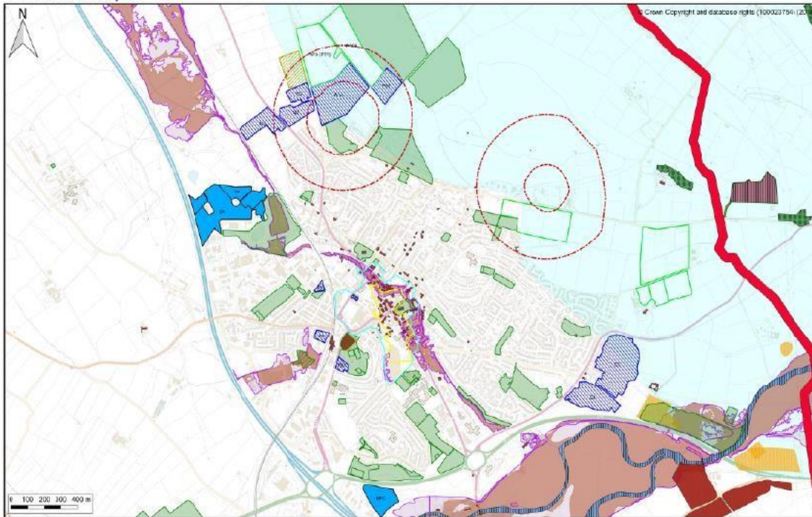
Penrith Inset Map 1