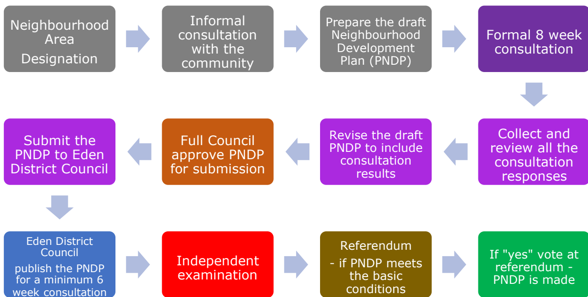
Figure 3. Neighbourhood Plan Process